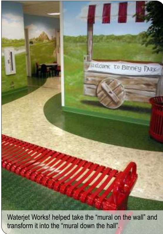
Waterjet Works! helped take the "mural on the wall" and transform it into the "mural down the hall".