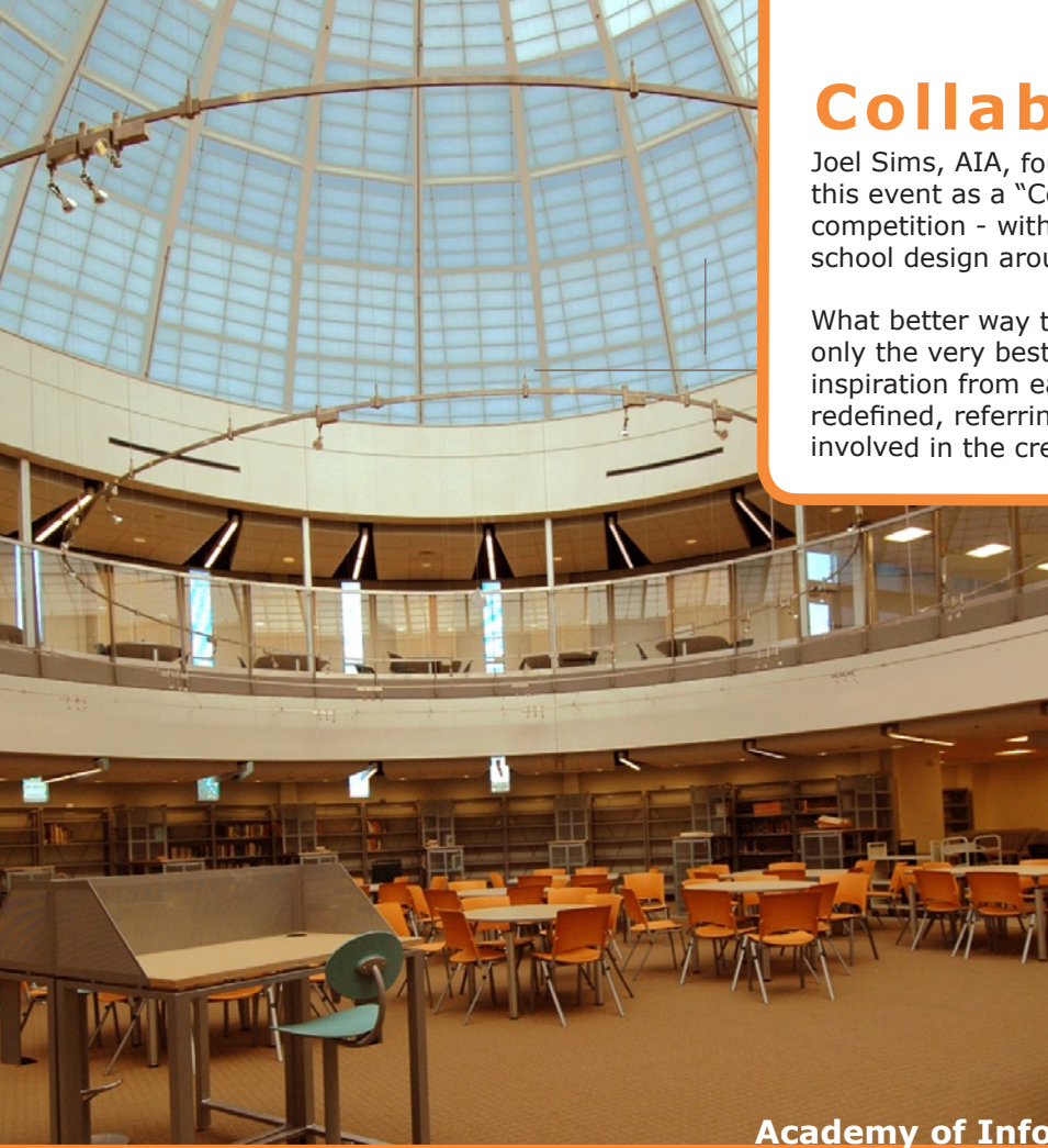
Academy of Info